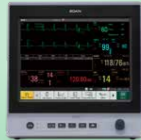
X VET Series Veterinary Monitor