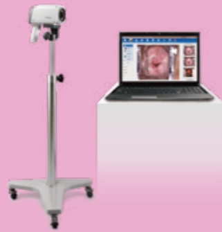
C3A/C6A Video Colposcope