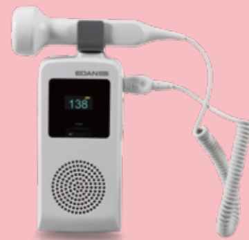
SD3 Ultrasonic Pocket Doppler