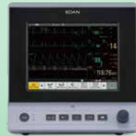
X8 Patient Monitor