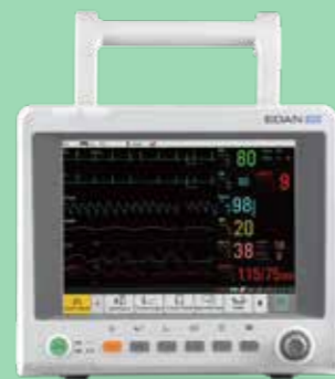
iM60 Patient Monitor